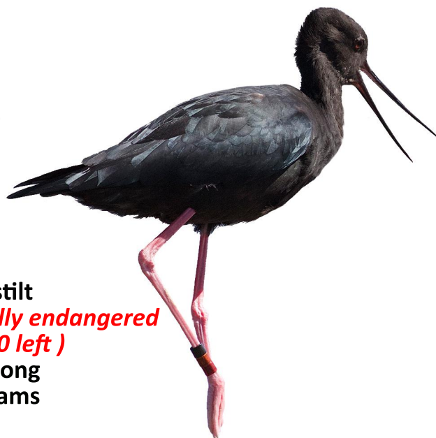
Black stilt Critically endangered (just 70 left ) 40cm long 220 grams